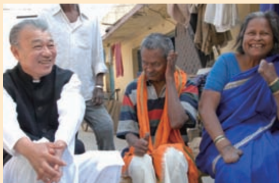
Stopping to chat with colony residents

With regard to that, I am hopeful that the Sasakawa-India Leprosy Foundation will