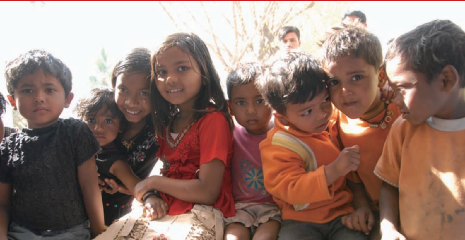
Children at Adarsh Kushta Ashram, a self-settled leprosy colony on the outskirts of Lucknow, India, photographed in March. (see p.7)