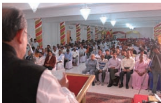
Health Minister Mishra (left photo) and Yohei Sasakawa address the Lucknow conference on March 1.