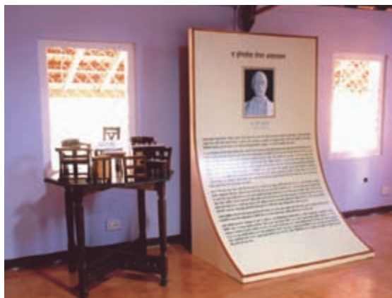
(Top) External view of the museum; (above) the refurbished interior