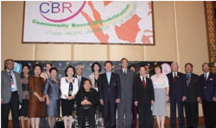
Opening ceremony of the Asia-Pacific CBR conference in Bangkok

Post-congress workshop looks at strengthening linkage between CBR and leprosy.