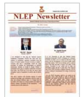
Communication tool: inaugural issue of the NLEP Newsletter (January-March 2016)