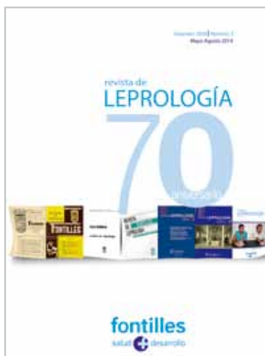
Helping the Spanish-speaking world to a better understanding of leprosy

We remain committed to the philosophy the journal has adhered to for more than 70 years, which is contributing to a better understanding of the disease of leprosy. ■