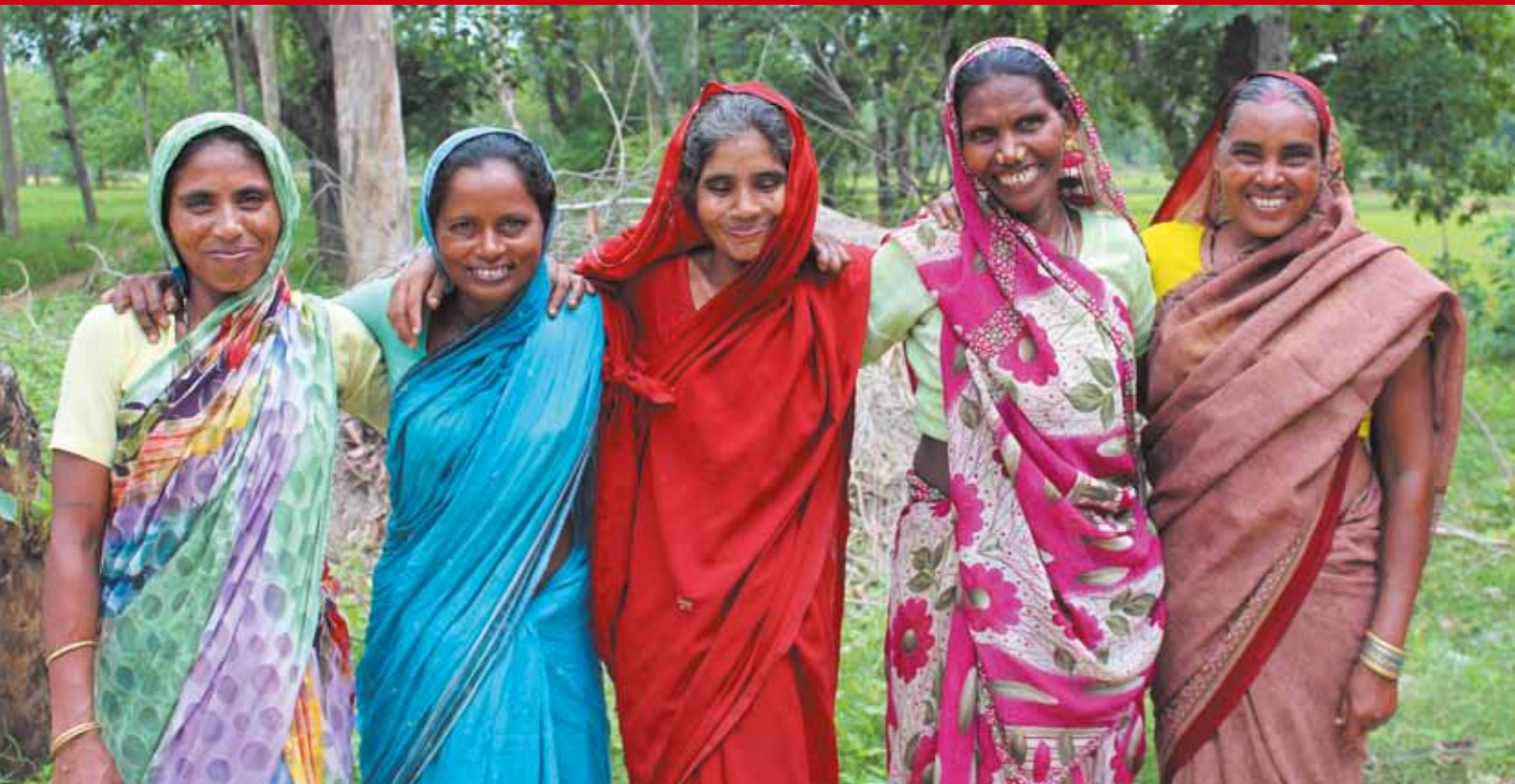
Dairy entrepreneurs in Chhattisgarh, India: these ladies are among the winners of this year's Rising to Dignity Awards. (See page 3)