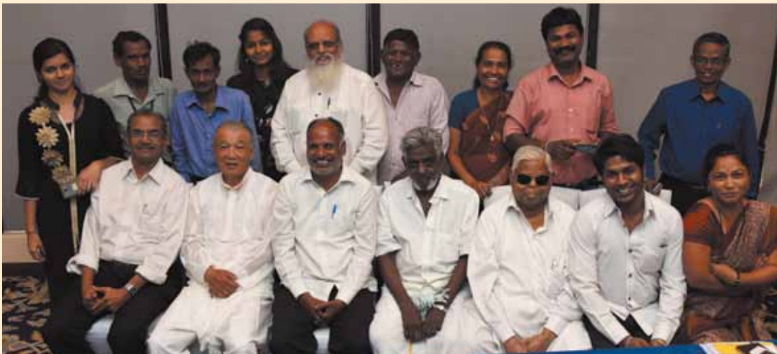
Posing for a commemorative photo with APAL leaders — and some of their children and grandchildren — in New Delhi

S-ILF was established in 2006 to support efforts at reintegrating people affected by leprosy through economic and social empowerment; it marks its 10th anniversary this year. S-ILF is active in three main areas — self-reliance, education and awareness training — and I received updates on its recent