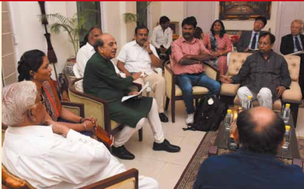
Greeting Ethiopia's minister of health (top) and attending a meeting with a delegation from Mozambique (above) in Geneva; at a gathering of the Forum of Parliamentarians for a Leprosy-Free India in New Delhi (above right)

projects. It is planning a special anniversary event for 2016 that will be announced in due course.